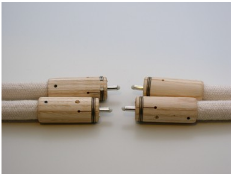
Picture 2, the wood RCA plugs

Speaker Cable: Guerilla Audio Silver Cable