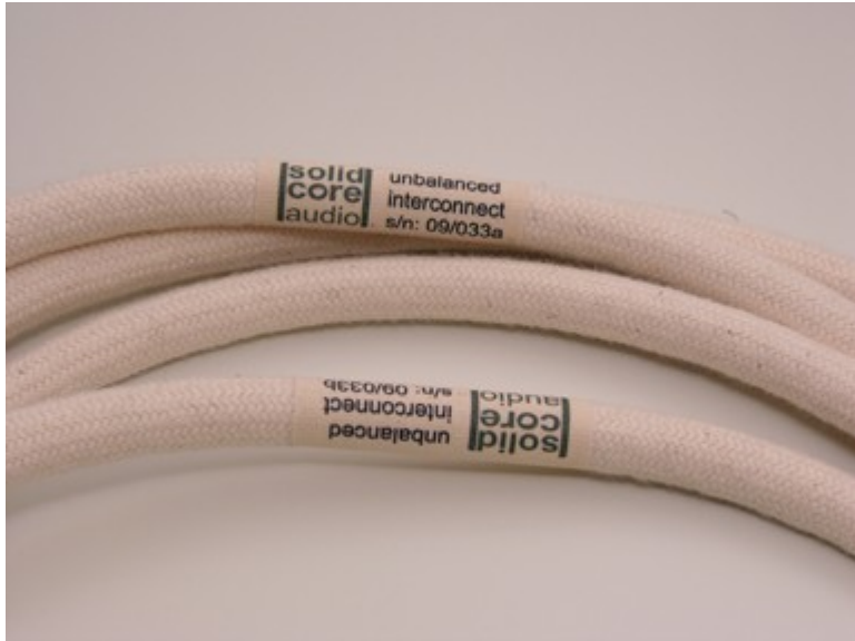
Picture 1, SOLIDCOREAUDIO solid-core silver cable with cotton sheathing